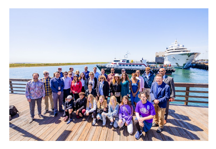
Local leaders had a special opportunity to learn about the Seaport Climate Science Program on April 6, 2023, observing students as they rotated among hands-on STEM learning stations in Pepper Park, National City.

among STEM learning stations aboard a research-equipped vessel that launched from Pepper Park in National City.